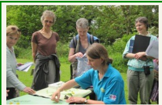
Plantlife ID at Great Billing

Conservation charity Plantlife ( www.plantlife.org.uk ) is involved in a range of projects and activities including practical conservation of plants and their habitats, and on speaking up for the nation's wild plants through lobbying, campaigning and education initiatives. For many years Plantlife has also been encouraging the public to collect data so that the state of the nation's flora can be monitored through the Wildflowers Count survey, formerly Common Plants Survey.