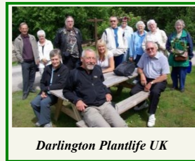
Darlington Plantlife UK