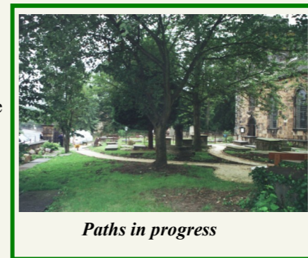
Paths in progress