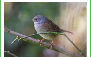
Dunnock