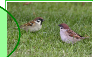
Tree sparrows