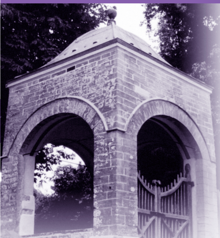
The lychgate at St. Mary's church, Kington was rebuilt in 2005 in the same style as the C18th one it replaced. Built of brick with an ornate lead roof, the lychgate has tall oak gates.