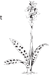
Early Purple Orchid

The intriguing folklore associated with burial customs harking back to pagan roots is extensive. This ancient worship of nature continued much longer in country parishes, notably in the Celtic west of Britain.