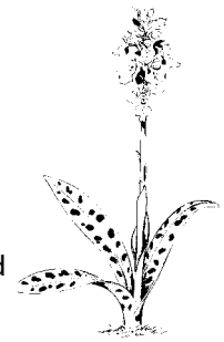
Early Purple Orchid

The intriguing folklore associated with burial customs harking back to pagan roots is extensive. This ancient worship of nature continued much longer in country parishes, notably in the Celtic west of Britain.