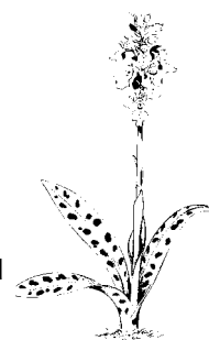
Early Purple Orchid

The intriguing folklore associated with burial customs harking back to pagan roots is extensive. This ancient worship of nature continued much longer in country parishes, notably in the Celtic west of Britain.