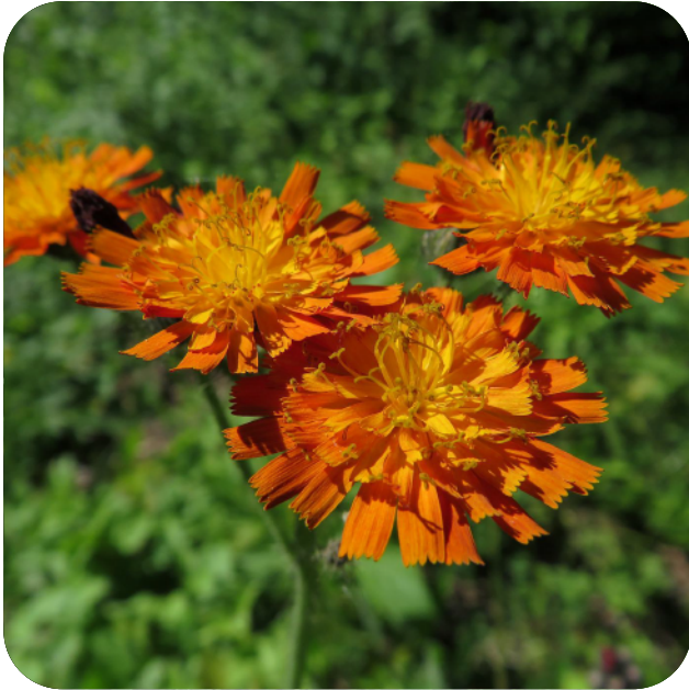
Fox and Cubs