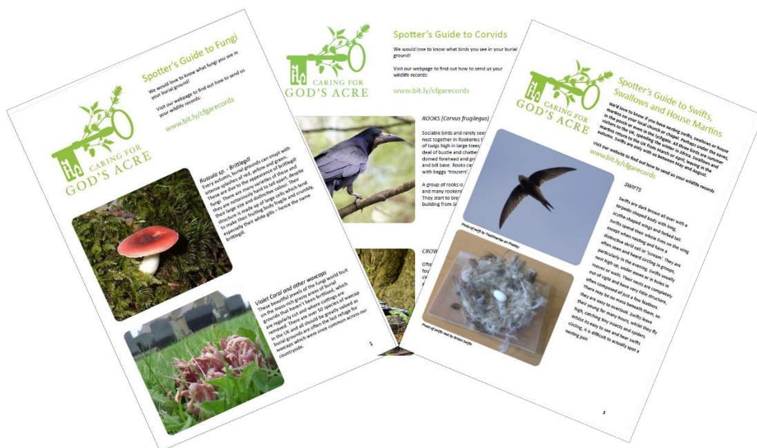
Spotter's Guides to Fungi, Corvids, and Swifts, Swallows and House Martins

We now have a formal role giving Environmental Support to the Church of England and produced 3 new spotters guides as part of this.